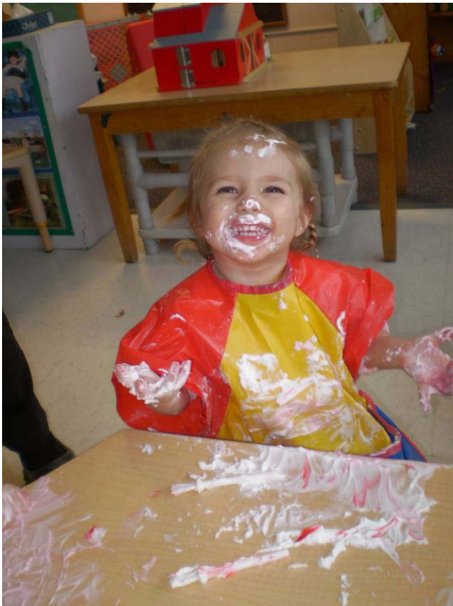
Pink shaving cream!

Recipes that involve bowls of lots of different ingredients are our class baking favorites. The recipe on the lid of an oatmeal box turned out to have lots of different things to stir and it was a major taste treat for the majority of the group.