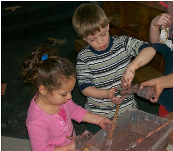
Making paper-maché dinosaurs

Mid-month, some of the children became very interested in dinosaurs. This emerged into building dinosaur habitats, drawing dinosaurs and building the skeletal structure with paper-maché and popsicle sticks, and finally naming their personal dinosaurs! During circle time, we brainstormed different reasons for the extinction of dinosaurs. Some of the children hypothesized scientific theories, while others regurgitated dinosaur movies they had watched. It was a very interesting conversation; one in which everyone participated! We also watched a dinosaur egg hatch! This was very exciting for everyone. We placed a special egg in a bowl of water (green, just for the effect) and watched its progress until the baby dinosaur came out. This process took about three days. The children got so interested that we found dinosaur eggs (huge snowballs) outside and the children helped crack them open to see what kind of the dinosaurs were inside!