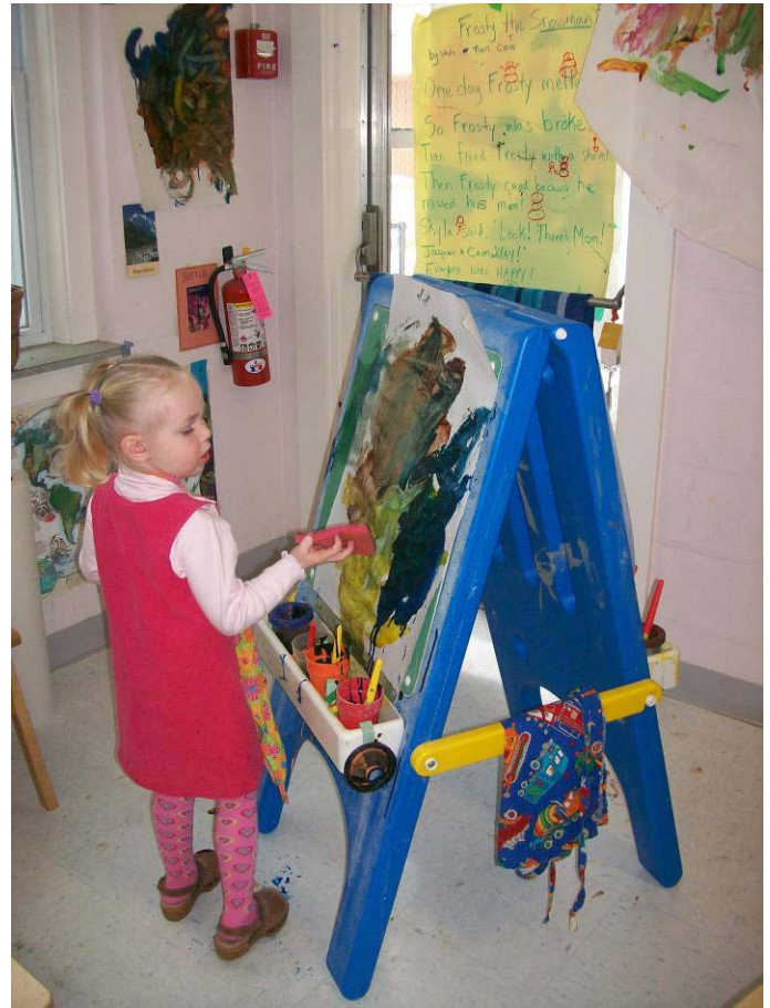
A young artist at work