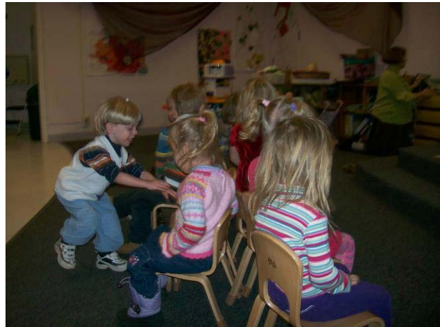
Playing Musical Chairs

In February the environment didn't always cooperate for outdoor time so we had to be very creative in ways to help the students get their energy out. We made obstacle courses with the students. These obstacle courses targeted many skills. One of the skills was problem solving. The students were very active in helping to design the courses. They would often try different configurations but most of them liked the "running part" of the course. Another skill that the obstacle courses help to develop is the children's sense of balance. The balance beam was one of the favorite things for them to work with. They would make it thick and short or long and twisty. They really liked the challenge of crossing the beams with "no help"!