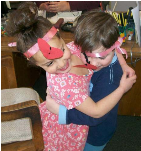
“Sharing the Love” on Valentine’s Day