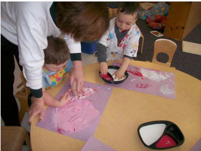
Making Valentine's Day paintings

February was such a short month! It was full of lots and lots of snow! Some of the things that we worked on for February were indoor gross motor activities, math concepts, and an exploration of Social Emotional curriculum.