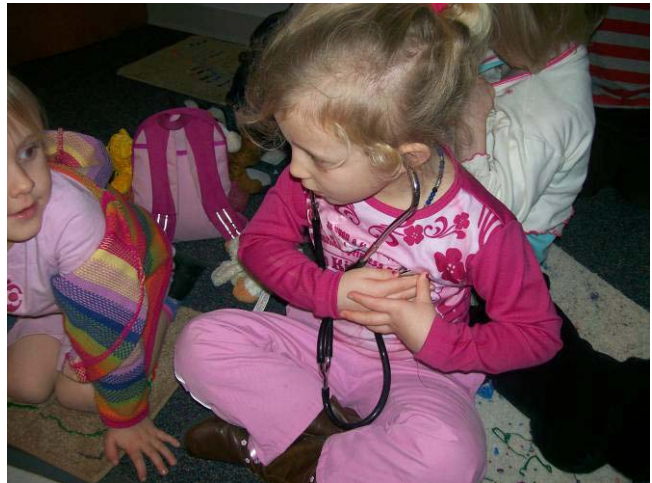
Listening with the stethoscope

waiting room, medical kits for the doctors, and books about our bodies. Children were coming in for broken arms, legs and the occasional head injury. During story time, we read books about going to the doctor’s office. The children were quite interested about the examination part of the visit and then the “sticker/ lollipop” part!