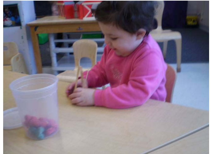
Pink play dough

The color pink was explored with valentine collages, pink play dough, color blending red and white finger-paint, and adding red food coloring to shaving cream.