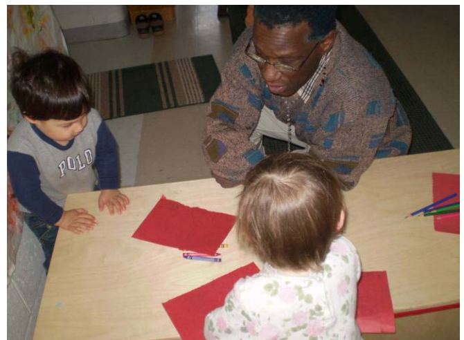
Valentine's Day art project

We used flannel hearts and textured hearts. We counted stuffed hearts. We followed up on the valentine theme with the song "Skidamarink-a-dink" and the turn-taking game "A Tisket a Tasket." (A child in the center of the "Ring-Around the Rosy" type circle hands the basket over to another child when we all sing "wrote a letter to my love and on the way I lost it...")