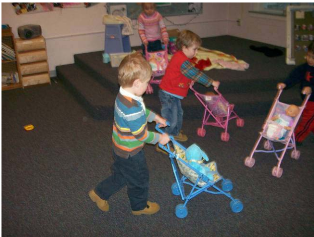
Strolling with baby dolls

Fortunately, this age group gives us lots of material to learn from! We are trying to empower the students to be their own advocate when something occurs that they don't like. We give them words so hopefully they are able to problem solve with words and not their bodies, although sometimes bodies are used. We do our best to keep everyone safe, but most importantly this is a learning opportunity for all. We use our circle time to discuss ways to solve conflict and also as a practice opportunity for using our words. Another element of problem solving is being able to self-regulate. We help the students to find ways to calm down like breathing techniques, counting, and walking away. Our social-emotional curriculum is an ongoing process and is something that we work on every day!